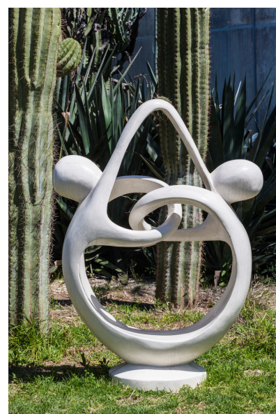
Garden art is subjective in the eye of the beholder.

Whether you lack a budget or courage, mixing art objects among your plants can be daunting. However, garden art can bring both form and function to your landscape while creating beauty and disguising eyesores. This presentation assists gardeners in answering the question, “What is art?” and defining their own artistic style. Photographs and recommendations for “safe” usage as well as horrible examples of “art gone wrong” will empower participants to fearlessly purchase or create man-made objects to place among their beloved plants. Handouts will provide guidelines and inspirations.