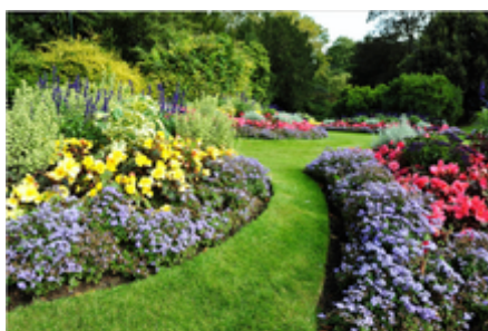
The joy of being an Extension Master Gardener