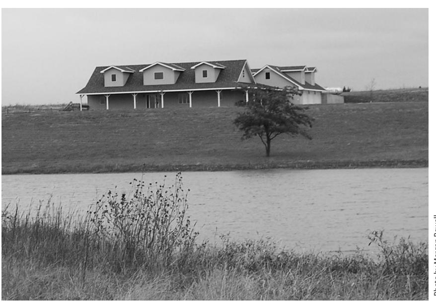
A central Kansas rural home.

Kansas has no statutory requirement for a seller to disclose. To avoid having a home sell while investigations are pending, make an offer and sign a contract contingent on home inspection and meeting certain standards.