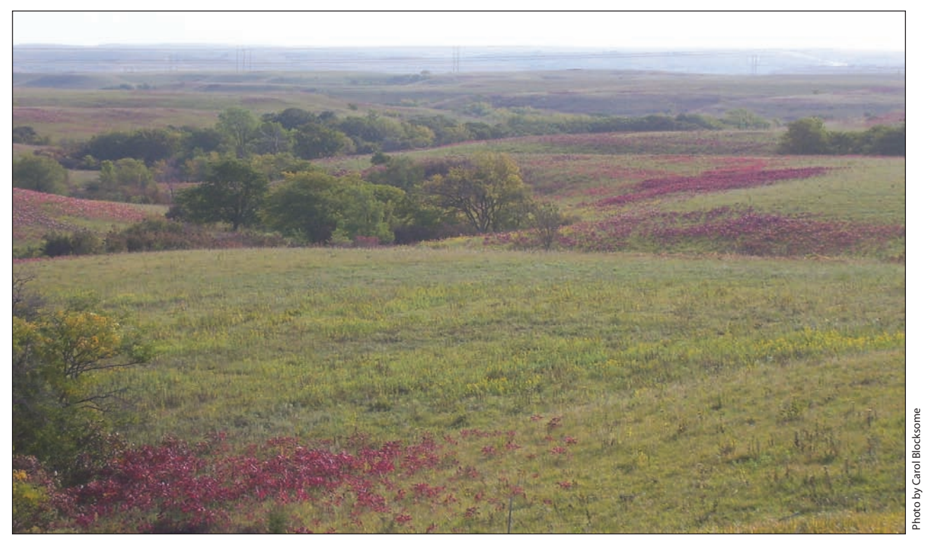
Scenic vistas, such as these sumac-colored hills in Riley County, are one of the attractions of country life.

This primer is designed to help prospective buyers make informed decisions about purchasing a home or home site in rural Kansas. It can also be a resource or reference for those new to country living. The local K-State Research and Extension office is also an important local resource for more information about topics related to living in the country. Extension agents can answer questions, provide referrals to specialists, and recommend extension publications for more in-depth information. Most extension publications are also available online at www.oznet.ksu.edu/library.