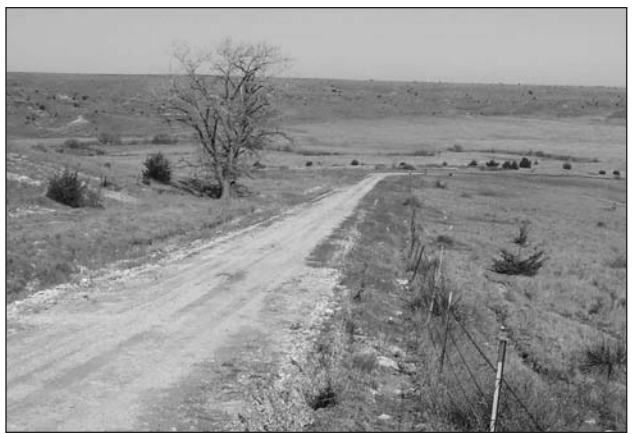
Roads in rural Kansas can range from smooth, well-marked two-lane highways (left) to gravel county roads (center) to dirt tracks (right). Road conditions depend on weather and maintenance. A gravel or dirt road that is easily passable in dry weather can become hazardous after a little rain, snow, or ice. Even paved roads deteriorate after winter's freezing, thawing, and salt treatment.

county offices; the local health department; mental health services; cemetery and library districts; and services for the elderly.