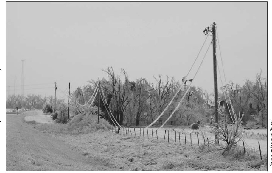
Downed power lines near Riley, Kan., after an ice storm.

mended because of fire and environmental hazards from burning metals, plastics, and other man-made materials. Call the fire department for a burn permit and notify the fire department or the sheriff every time burning occurs. When trash is burned, understand that the owner is responsible if the fire spreads. During drought periods, burning may be banned, and the landowner will have to store trash or have an alternative plan.