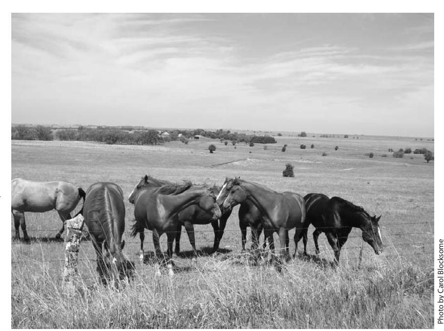
Horses graze in an Ellsworth County pasture.

Some pet owners decide they don't want a pet