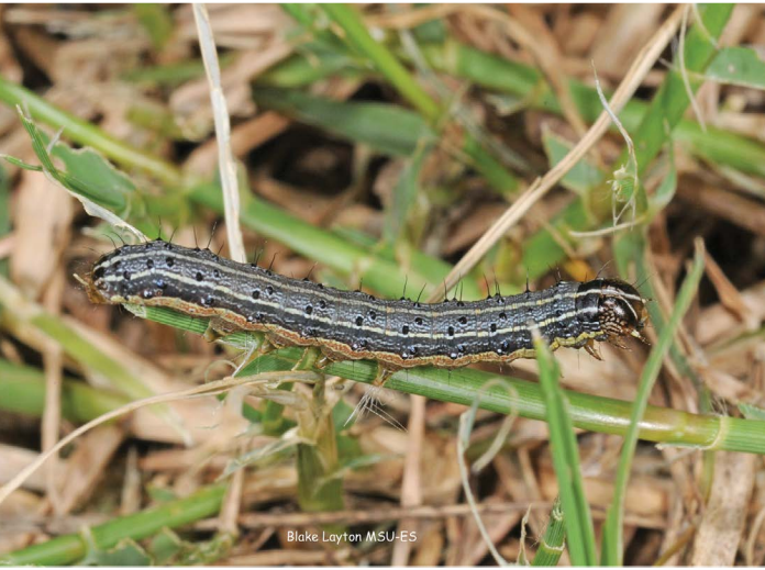
Figure 1. Fall armyworm caterpillars vary considerably in color, ranging from light green to nearly black.