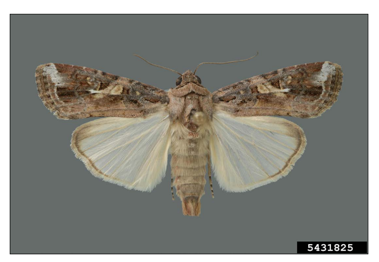
Figure 3. Male fall armyworm moths have light-colored markings on their forewings. Forewings of female moths are more uniformly gray. Moths of both sexes have light-colored hindwings.

Fall armyworm moths are about three-fourths of an inch long when resting with their wings folded. The forewings are gray to dark brown, but the underwings are white, which causes the moths to appear pale when in flight. Males have more white markings on their forewings than females do (Figure 3). Moths are active at night and spend the day resting in foliage. You will not often see the moths unless you go out at night with a spotlight to look for them or happen to flush one from its daytime resting place.