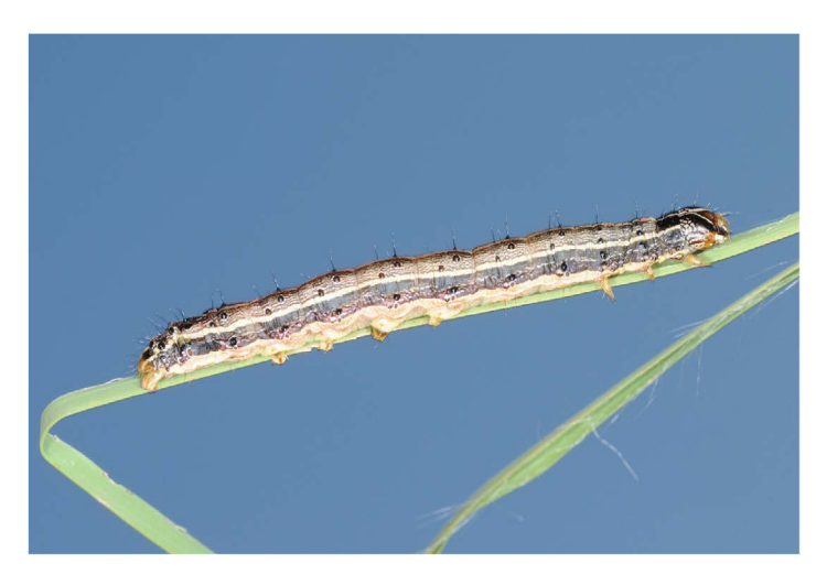
Figure 2. Fall armyworm caterpillars have smooth bodies with a few stiff hairs. Note the inverted, white Y or V shape on the head. All caterpillars have this structure, but it is particularly obvious on fall armyworms.