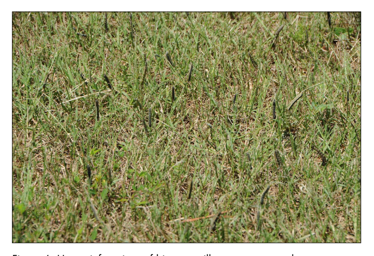
Figure 6. Heavy infestations of big caterpillars can consume large amounts of grass in a single day.

Like most caterpillars, fall armyworms do about 80 percent of their eating during their last two to three days as larvae—when they are "teenage" caterpillars. Therefore, if a field has reached threshold on Friday but is not scheduled to be cut until the next week, it needs to be treated as soon as possible. A moderate to heavy population of large fall armyworm caterpillars can eat a whole field of grass in just a couple of days (Figure 6). Be sure to pay attention to preharvest intervals when choosing an insecticide to use on a field that is near cutting!