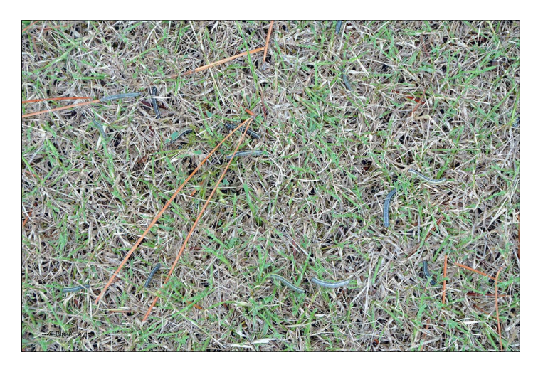
Figure 5. Treatment is recommended when counts exceed three caterpillars per square foot (do not count caterpillars that are less than one-fourth inch long).

The best way to avoid losing a cutting of hay to fall armyworms is to visit fields every 3 or 4 days and check for fall armyworms. Get out of the truck, get down on your hands and knees, and look closely. Scout for fall armyworms by vigorously ruffling the grass with your fingers and carefully counting the larvae that have fallen to the ground in a 1-square-foot area. Do this at several locations in the field and average your results. Treatment is recommended when counts exceed three caterpillars that are one-fourth inch or longer per square foot (Figure 5). Be sure to look carefully for small caterpillars. You want to find and treat them when they are small because small caterpillars are easier to control and, more importantly, have not eaten nearly as much as they are going to eat.